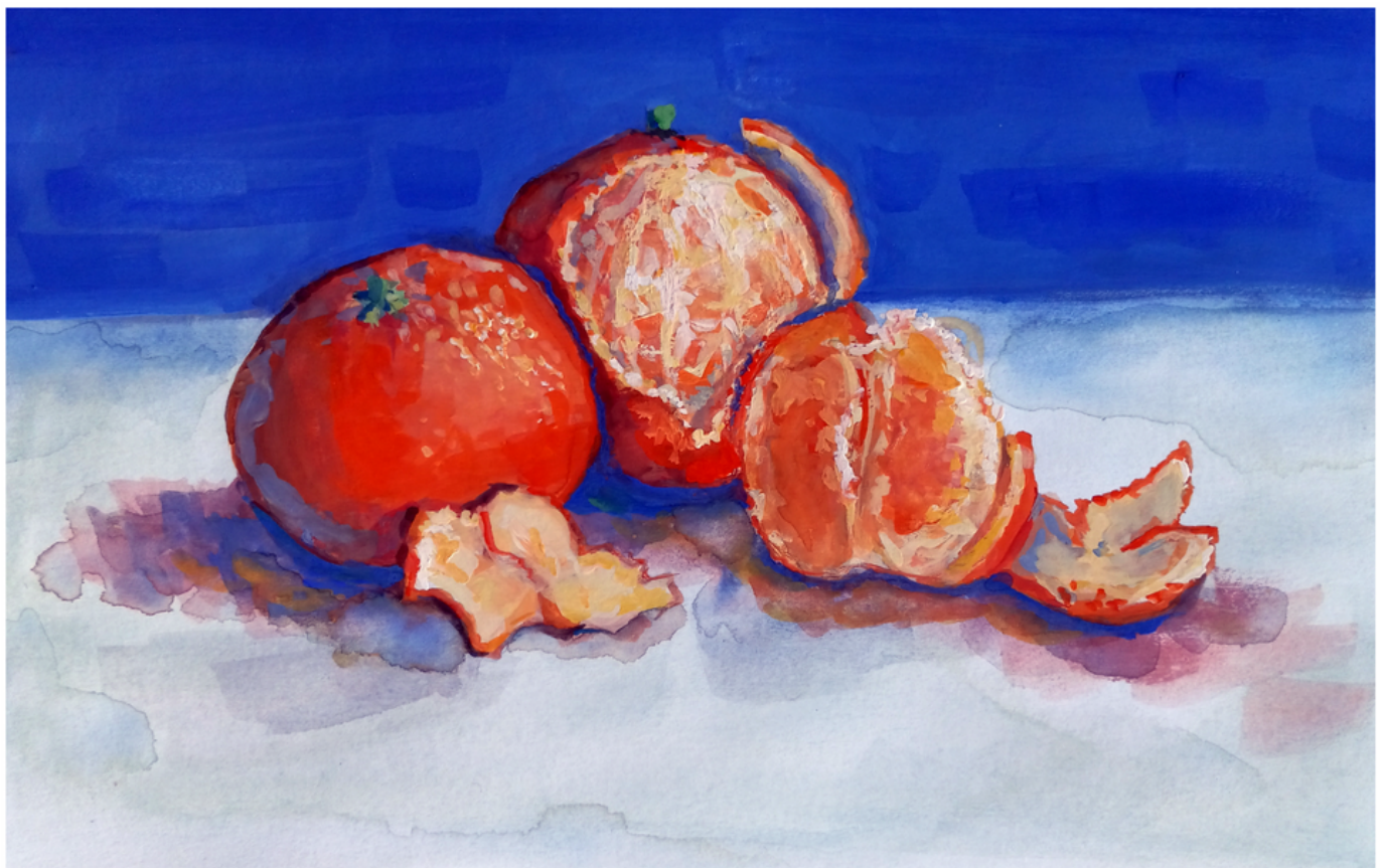
Art by Grade 12 Student Crystal Li